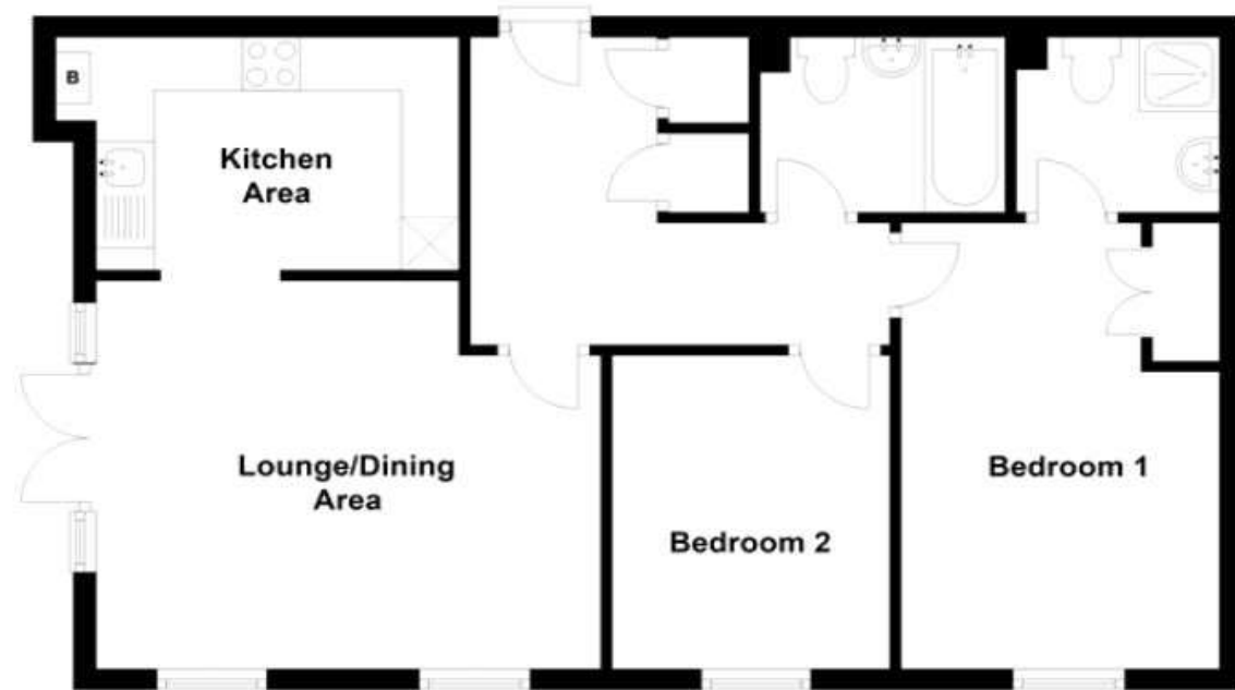
Ground Floor Approx. 58.3 sq. metres (627.3 sq. feet)