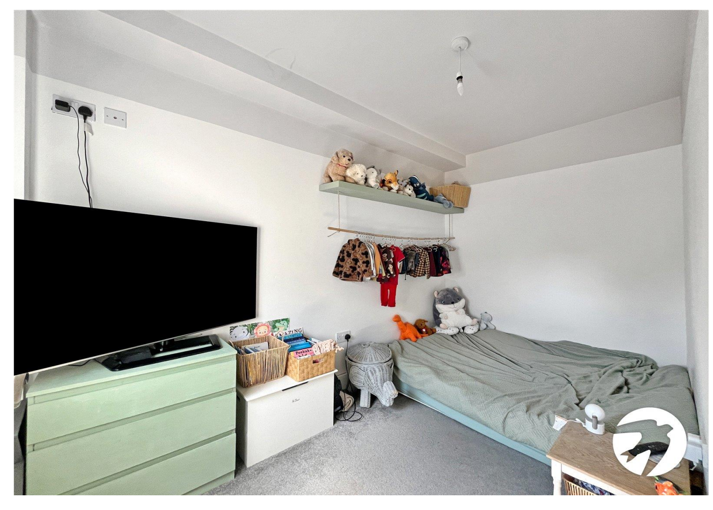
Council Tax - B EPC Rating - D