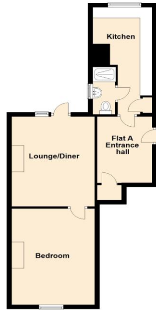
Lower Ground- Flat A