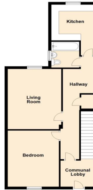
Ground Floor- Flat B