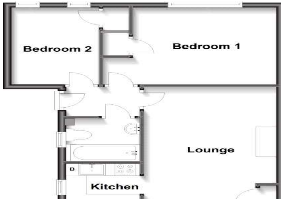
First Floor Approx. 46.8 sq. metres (504.2 sq. feet)