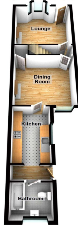
Ground Floor Approx. 44.2 sq. metres (476.2 sq. feet)