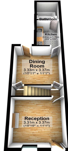
Ground Floor Approx. 34.1 sq. metres (366.8 sq. feet)