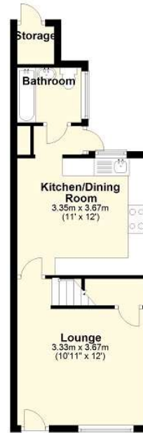
Ground Floor Approx. 34.1 sq. metres (367.5 sq. feet)