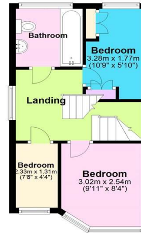
First Floor Approx. 30.0 sq. metres (322.8 sq. feet)