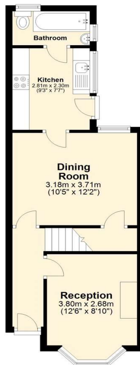
Ground Floor Approx. 36.3 sq. metres (390.2 sq. feet)