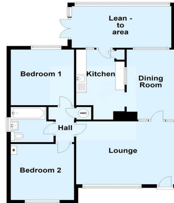
Ground Floor Approx. 76.7 sq. metres (825.9 sq. feet)

Total area: approx. 76.7 sq. metres (825.9 sq. feet)