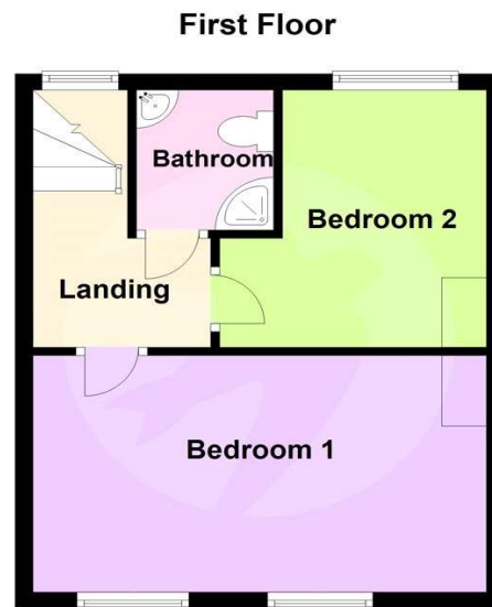
This floor plan is for illustrative purposes only. It is not drawn to scale. Measurements are approximate.