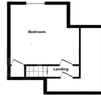
First Floor Floor area 30.0 sq ft (323 sq ft) approx

Total floor area 115.0 sq m (1,238 sq ft) approx This plan is for illustration purposes only and may not be representative of the property.