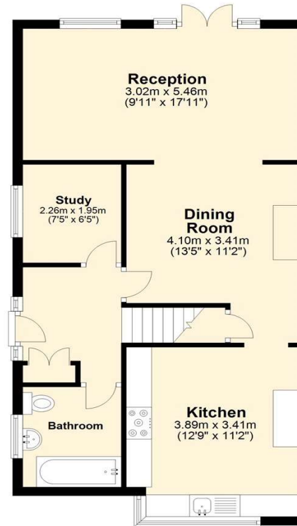
Ground Floor Approx. 59.5 sq. metres (640.6 sq. feet)