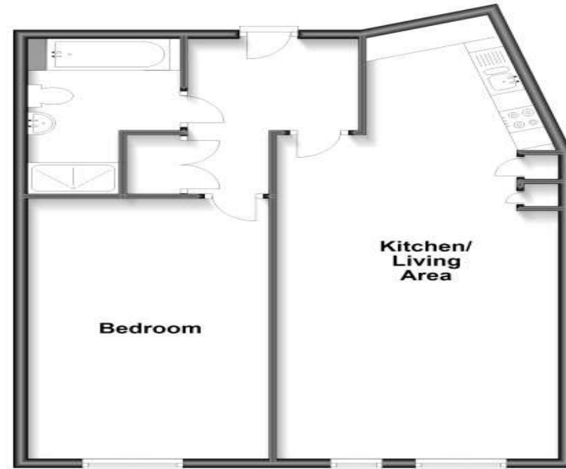
Second Floor Approx. 67.5 sq. metres (726.5 sq. feet)