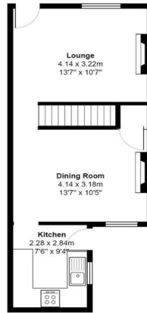
Ground Floor Area: 37.2 m 2 ... 401 ft 2

Rear Garden Approx 100ft Shingled area and lawn. Fenced in. Shed. East facing. Tap.