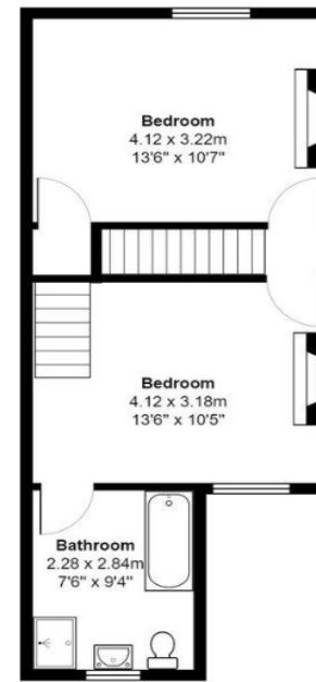
First Floor Area: 37.1 m 2 ... 399 ft 2