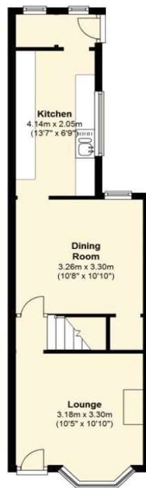
Ground Floor Approx. 44.7 sq. metres (481.4 sq. feet)