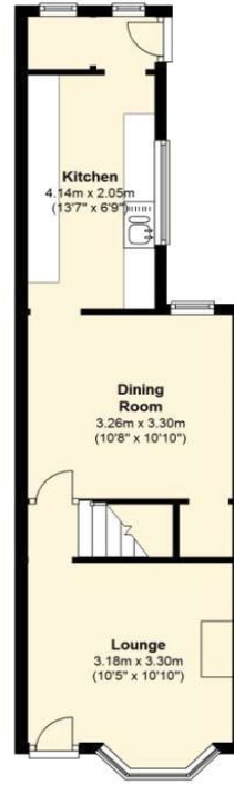
Ground Floor Approx. 44.7 sq. metres (481.4 sq. feet)