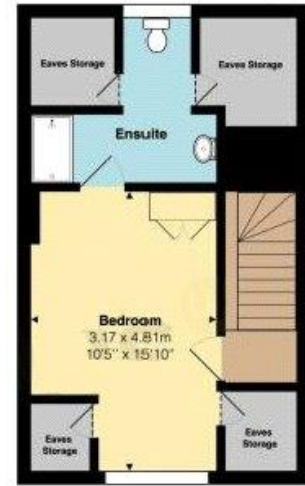
Second Floor Area: 33.8 m 2 ... 364 ft 2