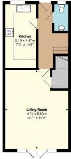
Ground Floor Area: 44.6 m 2 ... 480 ft 2